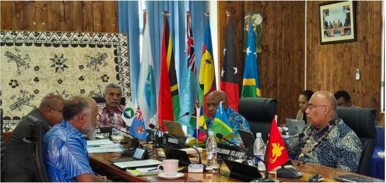
The 1st meeting of the Committee for Reinforcing Commitment to MSG got underway at the MSG Secretariat last month.

The Inaugural Committee for Reinforcing Commitment and Obligation towards the MSG (CRCO) was successfully convened at the Melanesian Spearhead Group (MSG) Secretariat last month.