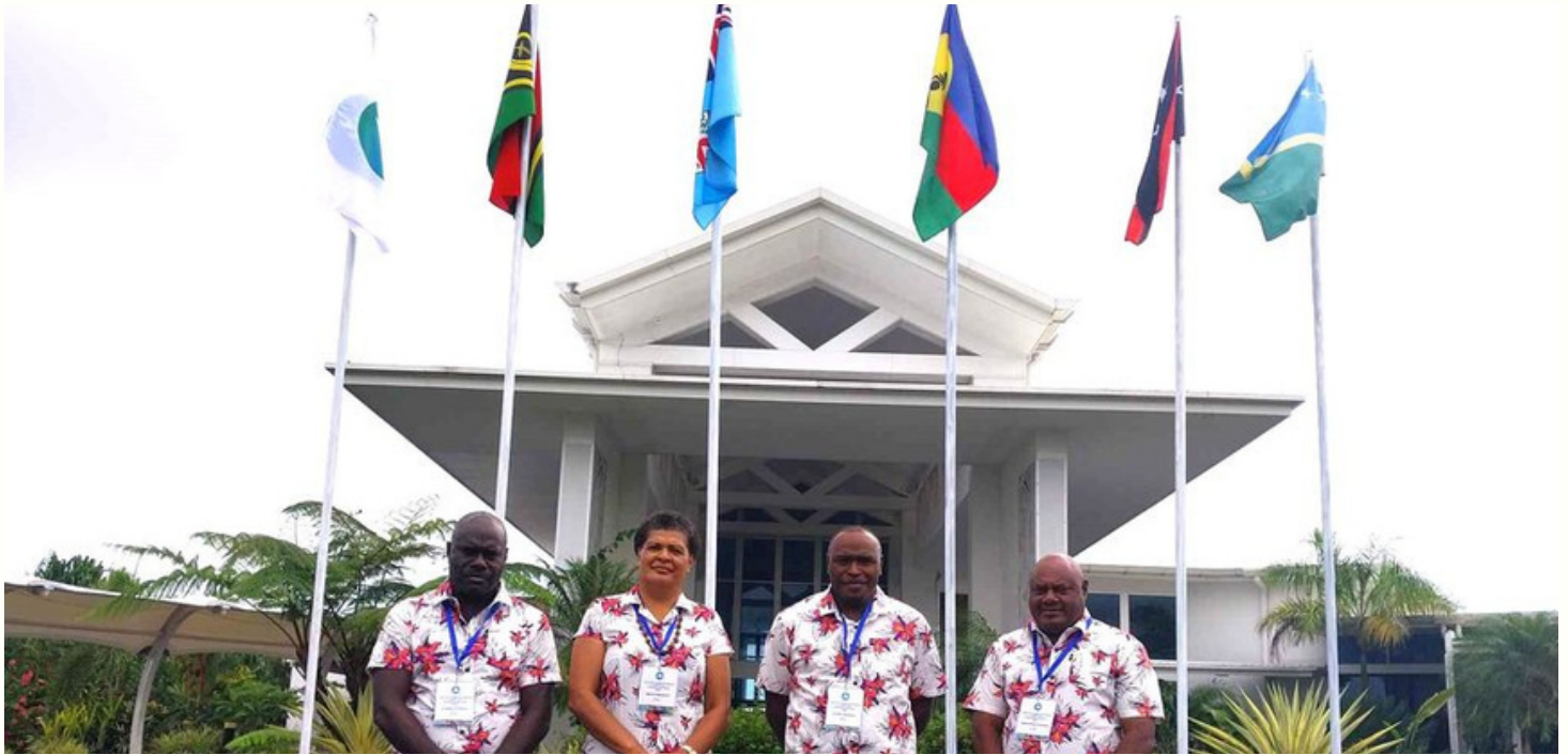
The Heads of Immigration in MSG Member countries at their first meeting in Samoa.

The first Melanesian Spearhead Group (MSG) Heads of Immigration Meeting (HOIM) was successfully convened in Apia, Samoa, last month, to discuss the MSG Business Travel Card (BTC) proposition and how it will be developed and implemented.