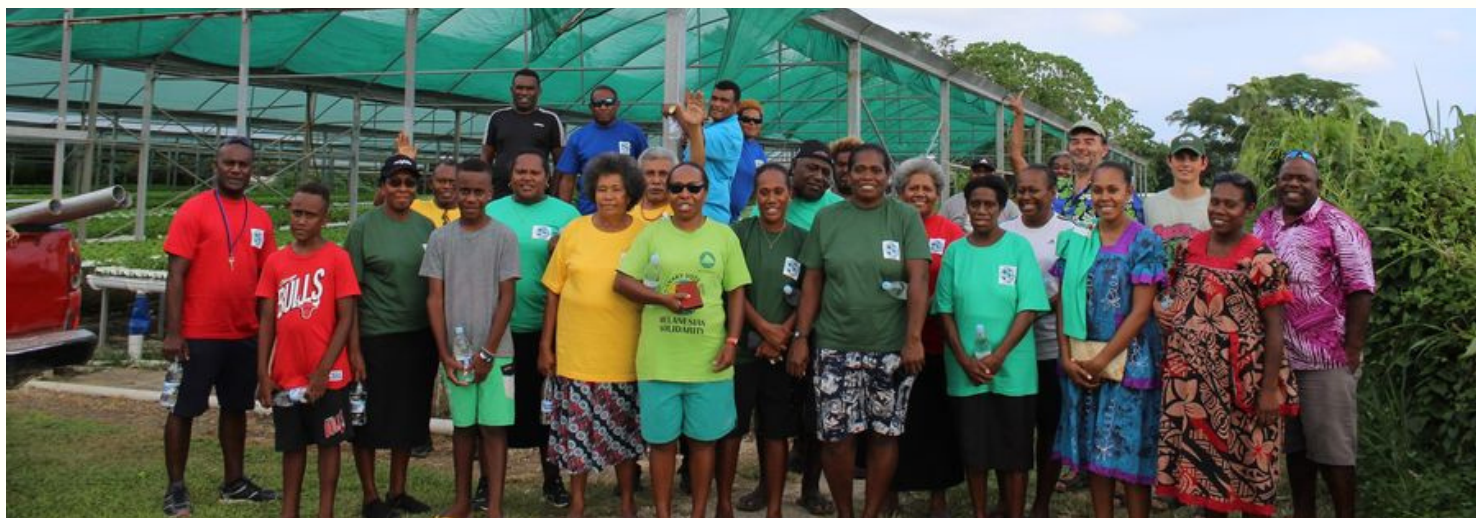
Staff of the MSG Secretariat during a visit to the Teouma valley farms.

Staff of the Melanesian Spearhead Group (MSG) Secretariat and their families have started the year with taking time off work every Wednesday afternoon to take part in physical exercise and activities.