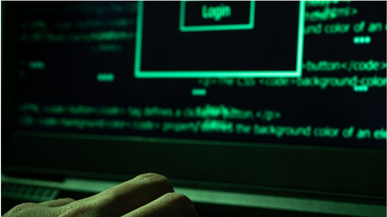
The MSG has called for concerted efforts to address cyber-crime.

The Melanesian Spearhead Group (MSG) Secretariat has called for strengthened collective efforts to address cyber-crimes by proactively investing in digital evidence awareness and capability in the region's law enforcement agencies.