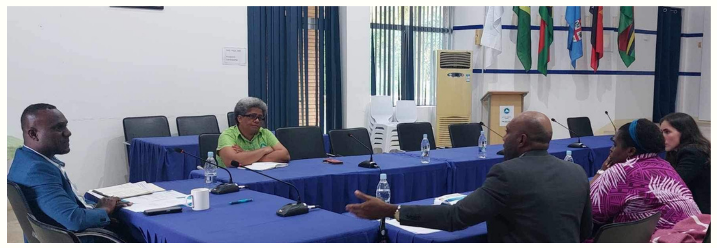
The MSG Secretariat team with their counterparts from the Pacific Islands Forum.

A senior team from the Melanesian Spearhead Group (MSG) Secretariat recently met with officers from the Pacific Islands Forum to discuss and identify possible areas of collaboration, in supporting the implementation plan for the 2050 Strategy for Blue Pacific Continent.