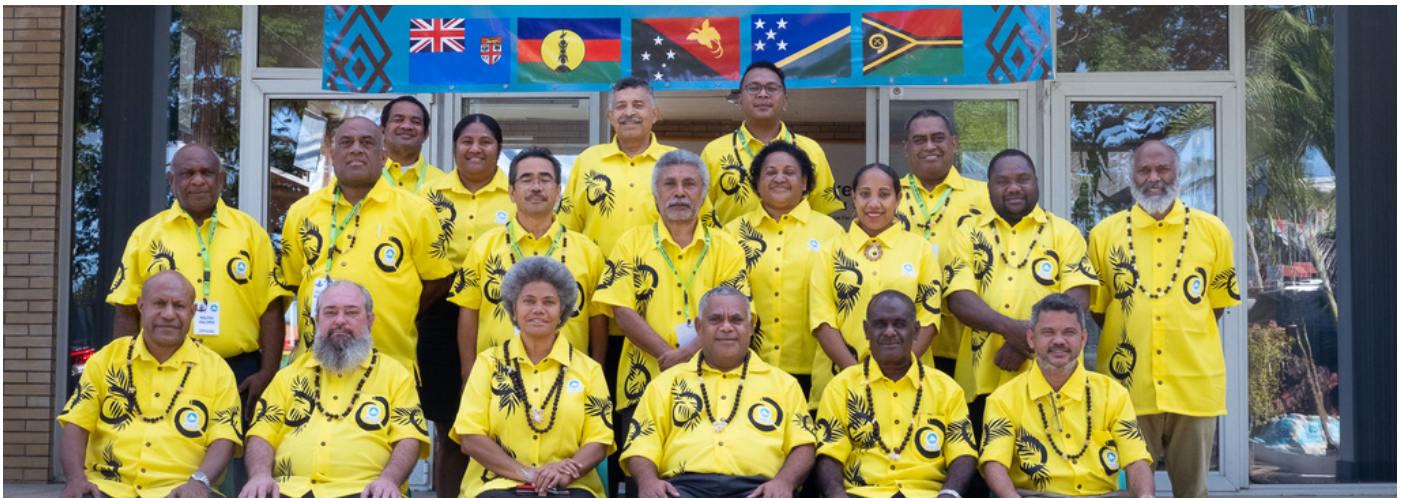
Members of the MSG Foreign Ministers Meeting and Senior Officials Meeting following the first in-person Governing Body since 2020.

The Melanesian Spearhead Group (MSG) Foreign Ministers Meeting (FMM) successfully concluded last month with Members approving the outcomes of the preceding MSG Senior Officials Meeting (SOM) at the MSG Secretariat in Port Vila, Vanuatu on Friday 30th June 2023.