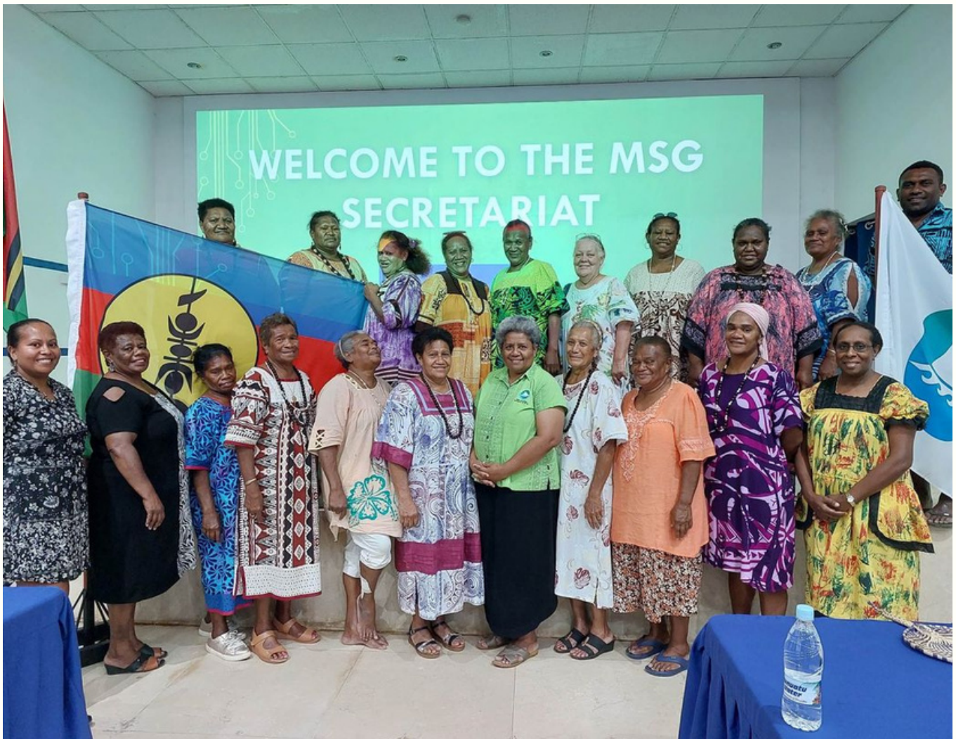
Members of the Rural Women of New Caledonia Association with some staff of the MSG Secretariat

The Melanesian Spearhead Group (MSG) Secretariat received a delegation of New Caledonian women entrepreneurs and agricultural farmers from the Rural Women of New Caledonia Association on April 17, 2023.