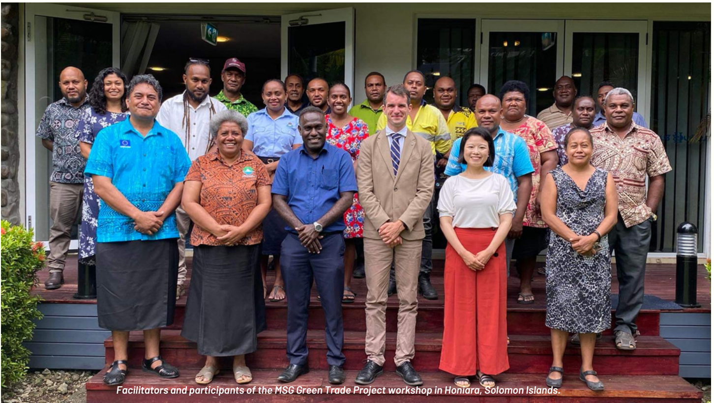
Facilitators and participants of the MSG Green Trade Project workshop in Honiara, Solomon Islands.

National workshops on the Melanesian Spearhead Group (MSG) Green Trade Project & Joint IMPACT-SAFE Workshop on Non-Tariff Measures (NTMs) & International Trade Promotion which began in Port Vila, Vanuatu earlier last month were concluded in the other MSG capitals of Suva, Honiara and Port Moresby.