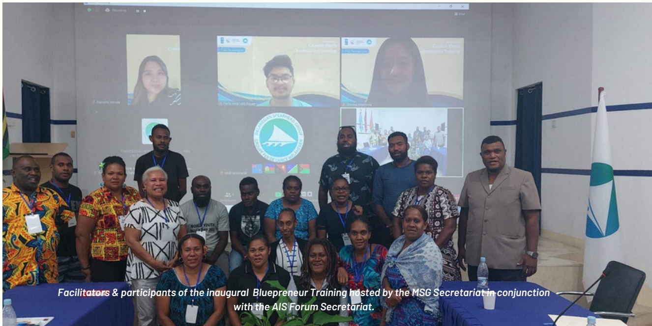
Facilitators & participants of the inaugural Bluepreneur Training hosted by the MSG Secretariat in conjunction with the AIS Forum Secretariat.

To empower coastal communities in Melanesia, the Melanesian Spearhead Group (MSG) Secretariat and the Archipelagic and Island States (AIS) Forum held a three-day training on Blue Economy and Entrepreneurship in the Pacific.