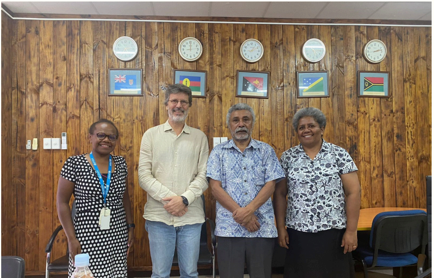
The MSG Secretariat and UNICEF teams after discussions on collaboration.

The Melanesian Spearhead Group (MSG) Secretariat and the United Nations International Children's Emergency Fund (UNICEF) are exploring possible options for collaboration.