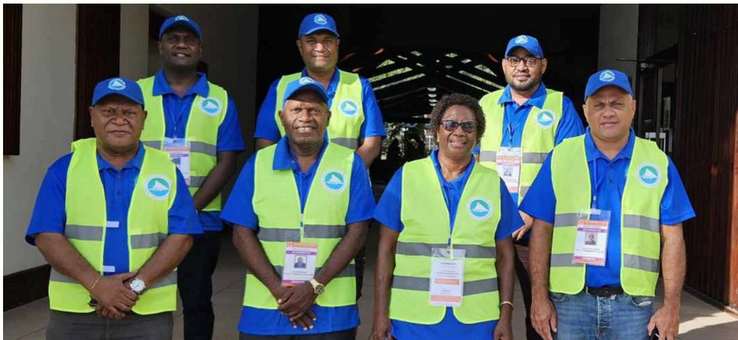
The MSG Observer Group to the 2024 Solomon Islands National General Elections.

A female led the Melanesian Spearhead Group Observer Group (MSGOG) to the 2024 Solomon Islands National General Elections upon invitation from the Solomon Islands Government.