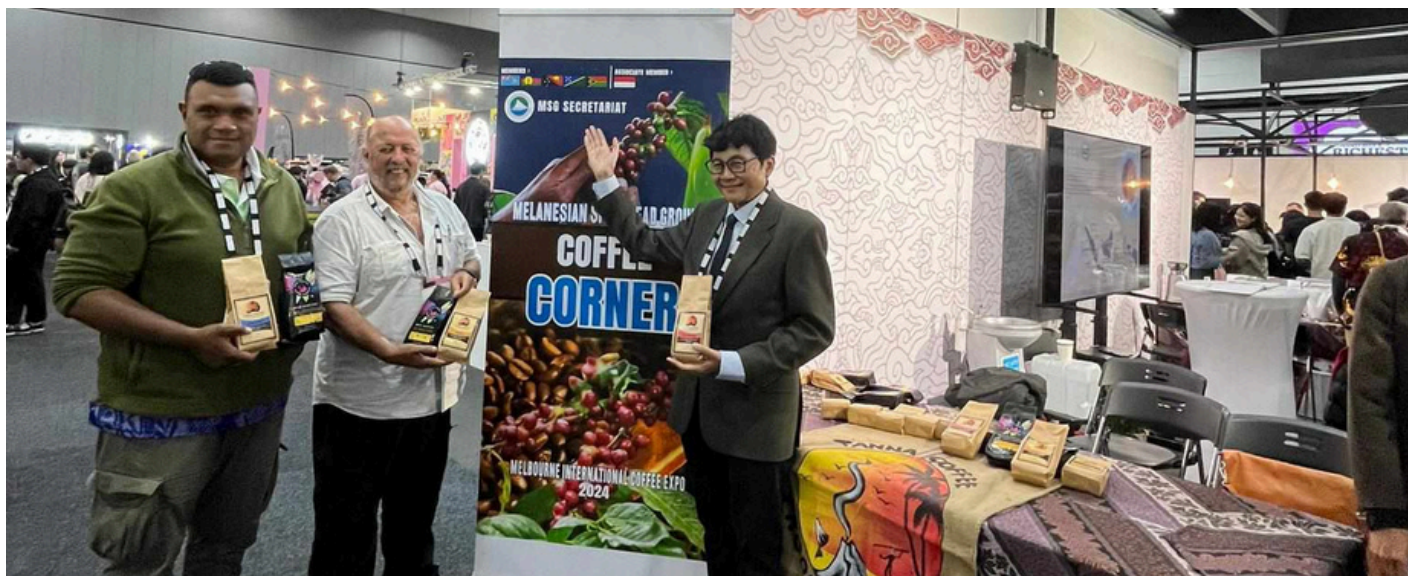
Tanna Coffee was on full display at the MSG booth during the International Coffee Expo in Melbourne, Asia Pacific's premier and most dynamic coffee-centric event.

The Melanesia Spearhead Group (MSG) participated at the Asia Pacific's premier and most dynamic coffee-centric event, International Coffee Expo from 12-14 May in Melbourne, Australia.