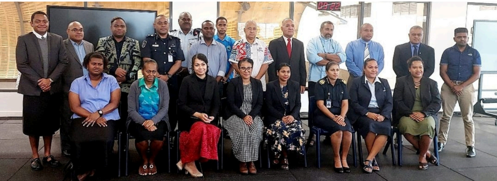
Members of the MSGSS Working Group, MSG representatives and those from Fiji NGOs and CSOs following the MSGSS consultation in Suva.