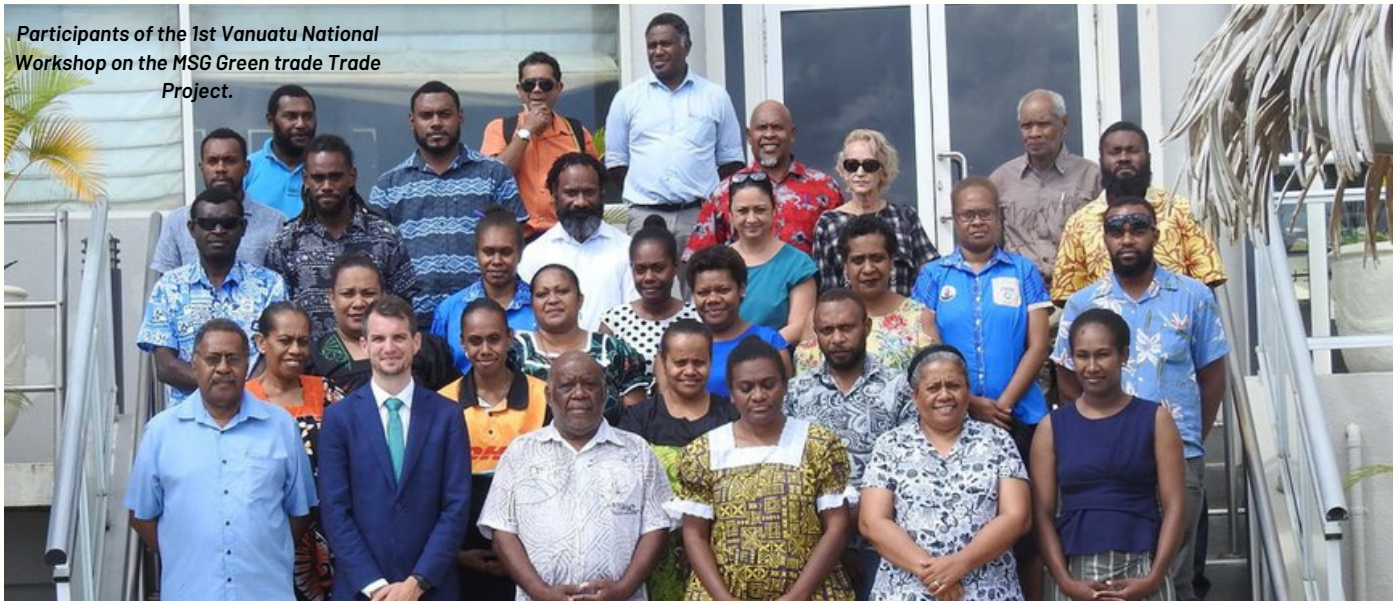
Participants of the 1st Vanuatu National Workshop on the MSG Green Trade Project.

As small island states, the Melanesian Spearhead Group (MSG) face economic vulnerabilities due to smallness in size, distance to markets, narrow export base, susceptible to natural disasters and global challenges, among other issues. Hence the importance of the United Nations Conference on Trade & Development (UNCTAD) – MSG Green Trade Project, which aims to address narrow resource and export base for Members, and encourage sub-regional and international trade.