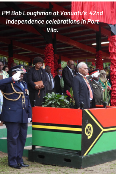
PM Bob Loughman at Vanuatu's 42nd Independence celebrations in Port Vila.