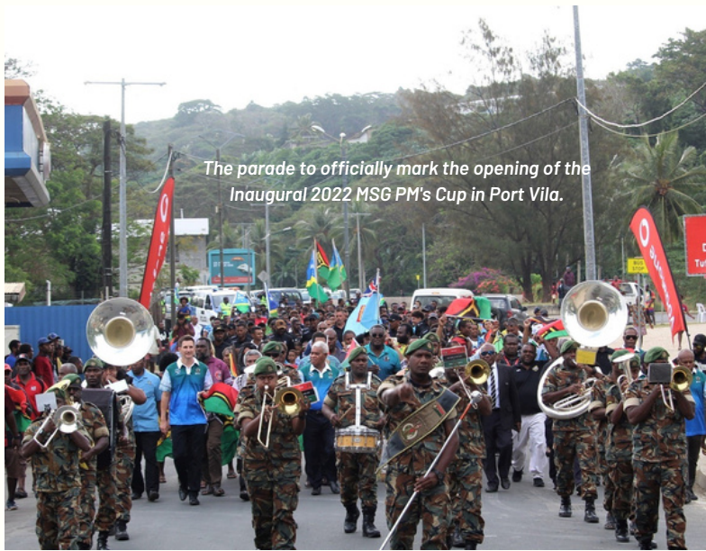
The parade to officially mark the opening of the Inaugural 2022 MSG PM's Cup in Port Vila.