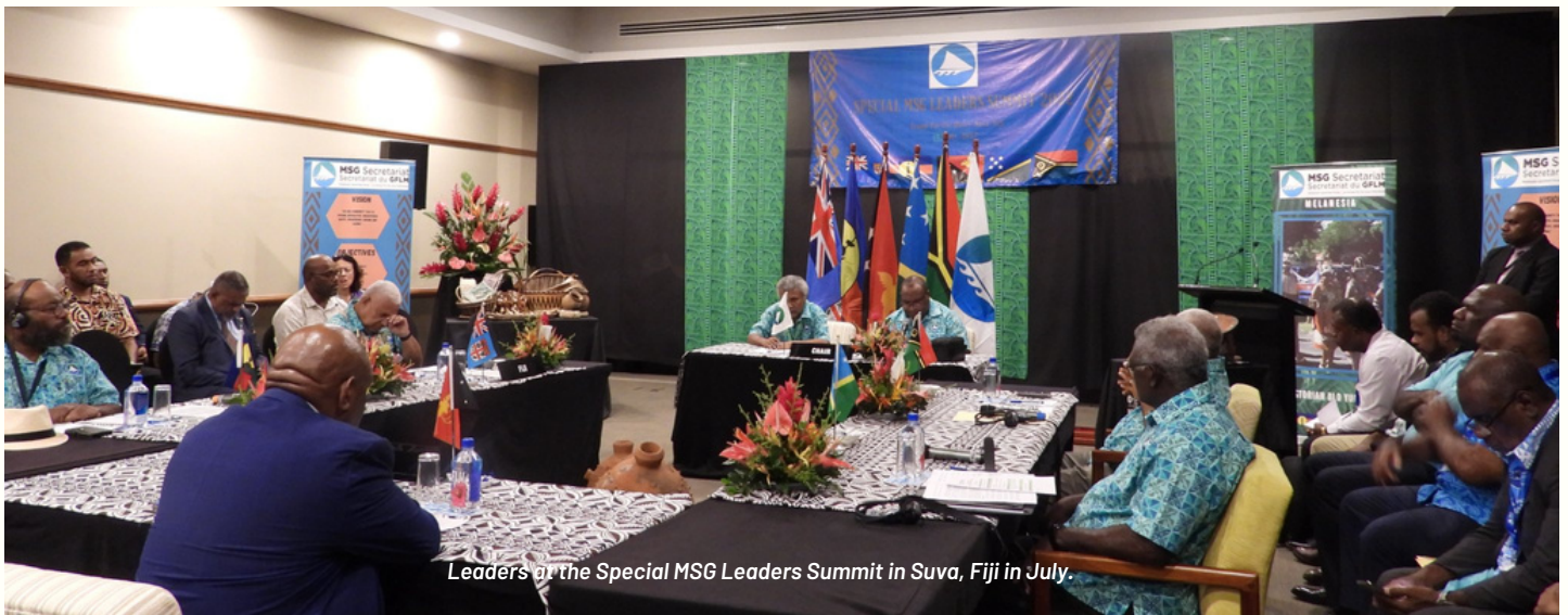
Leaders at the Special MSG Leaders Summit in Suva, Fiji in July.

The Melanesian Spearhead Group (MSG) Chairmanship was handed over from Papua New Guinea (PNG) to Vanuatu during the Special MSG Leaders Summit at Suva's Grand Pacific Hotel in Fiji on July 13.