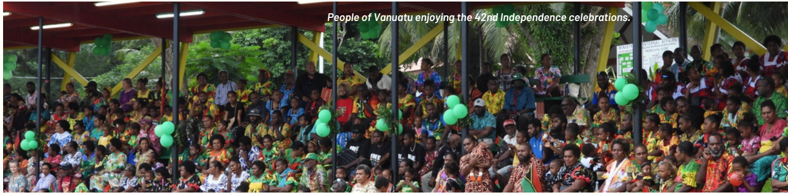
People of Vanuatu enjoying the 42nd Independence celebrations.

Independence anniversaries usually commemorate the declaration of independence and is also a day to celebrate nation-building. All three anniversaries were celebrated by the respective Melanesian communities in Port Vila, Vanuatu by parades, speeches, cake-cutting, flag-raising ceremonies and entertainment.