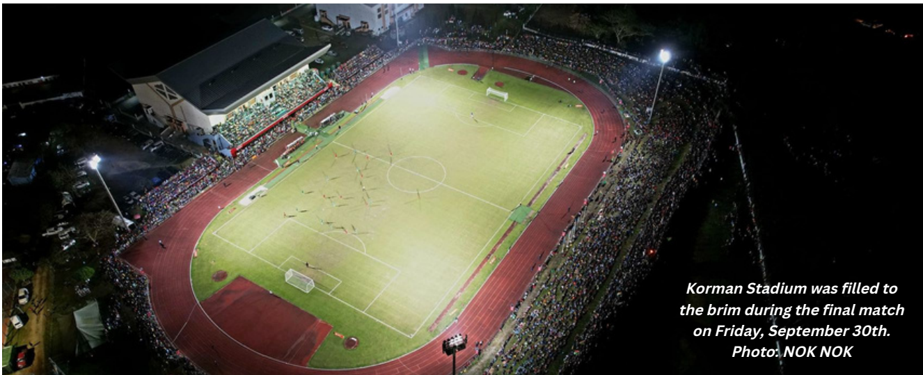
Korman Stadium was filled to the brim during the final match on Friday, September 30th.