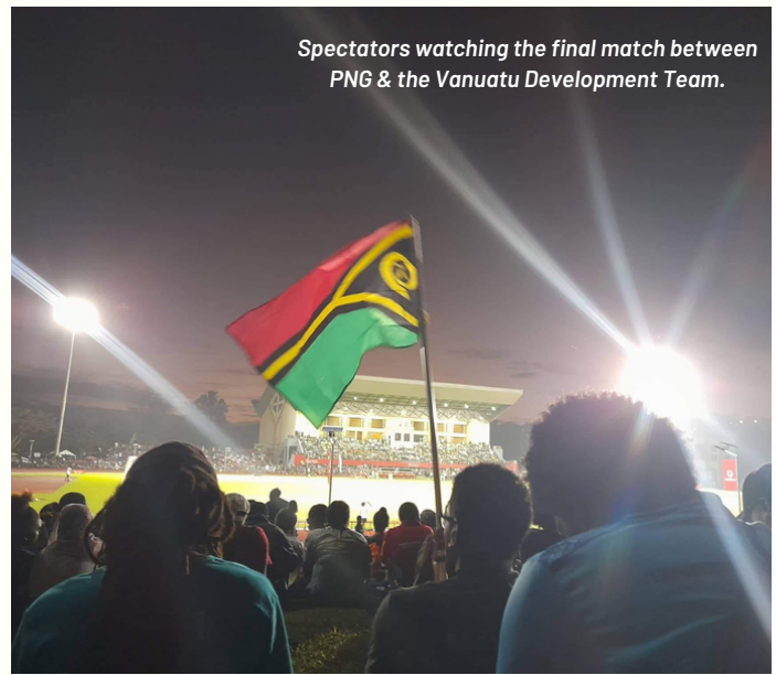
Spectators watching the final match between PNG & the Vanuatu Development Team.