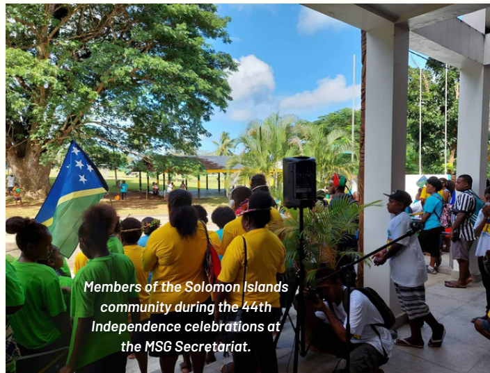
Members of the Solomon Islands community during the 44th Independence celebrations at the MSG Secretariat.