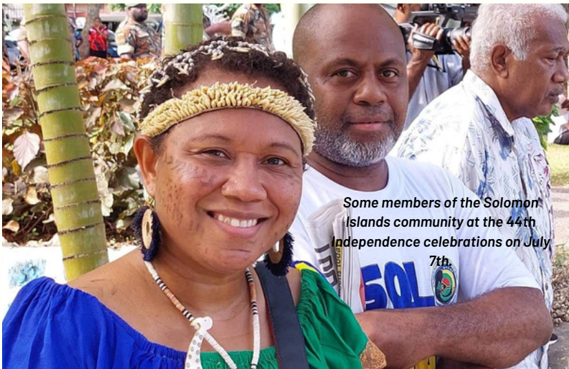
Some members of the Solomon Islands community at the 44th Independence celebrations on July 7th.