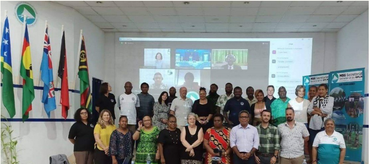
Participants of the SPIRIT Dialogue with the Vanuatu Chamber of Commerce.

A breakfast meeting initiative which provided a platform for awareness on the EU-funded Strengthening Pacific Intra-Regional and International Trade (SPIRIT) project and the Melanesian Free Trade Agreement (MFTA) saw meaningful consultations with members of Vanuatu's Chamber of Commerce and Industry. The dialogue enabled participants to discuss and identify Vanuatu's private sector needs to enable them to benefit from the Interim