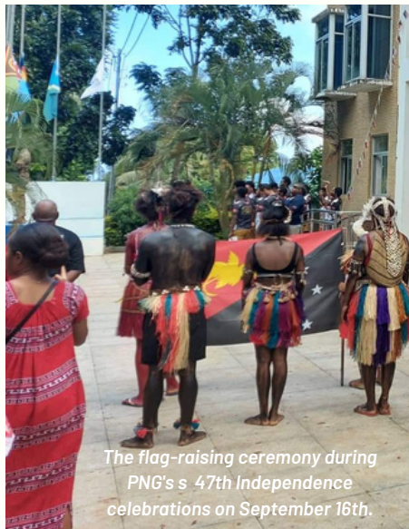
The flag-raising ceremony during PNG's 47th Independence celebrations on September 16th.