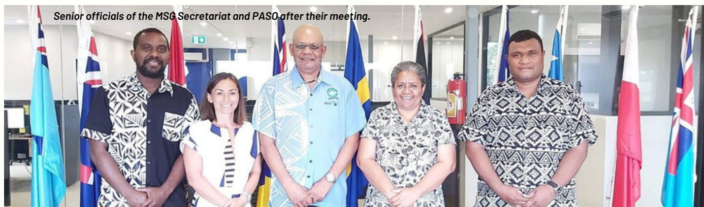
Senior officials of the MSG Secretariat and PASO after their meeting.

A meeting on 25 August 2022 between senior officials of the MSG Secretariat and the Pacific Aviation Safety Office (PASO) in Port Vila discussed possible areas of collaboration. It was the start of a series of meetings between the two organisations and a Memorandum of Understanding (MOU) is being