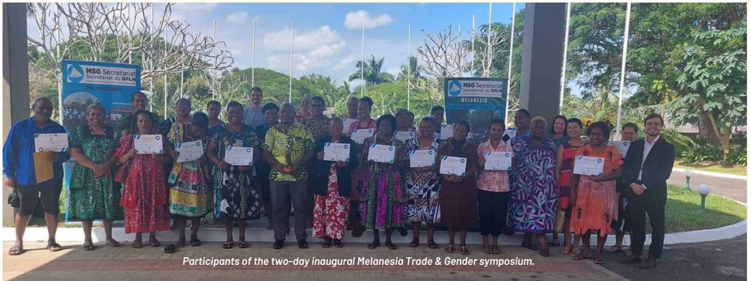
Participants of the two-day inaugural Melanesia Trade & Gender symposium.

The Melanesian Spearhead Group (MSG) Secretariat in conjunction with the Pacific Islands Forum Secretariat (PIFS) organised the region's first Trade & Gender Symposium in Port Vila, Vanuatu.