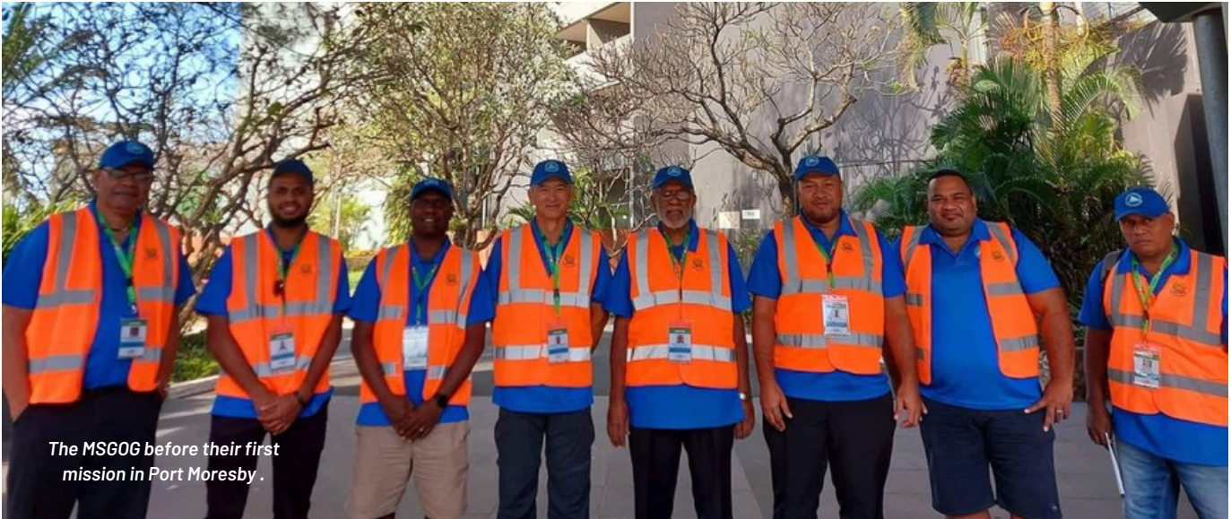
The MSGOG before their first mission in Port Moresby.

An MSG Observer Group was deployed to Port Moresby to observe the 2022 Papua New Guinea (PNG) National General Elections (NGE), led by the former President of Vanuatu, His Excellency Kalkot Mataskelekele.