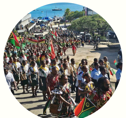
The people of Vanuatu celebrated their 44th Independence Anniversary in July.

PRODUCED BY THE MEDIA & COMMUNICATIONS UNIT OF THE MSG SECRETARIAT