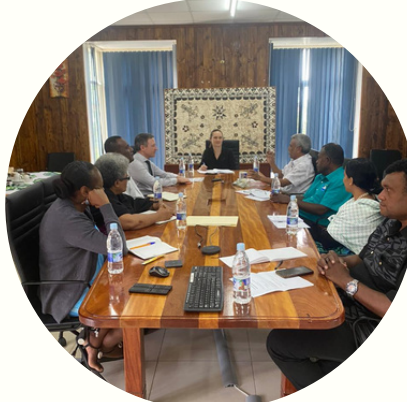
The Secretariat received a courtesy call from the new Australian High Commissioner to Vanuatu.