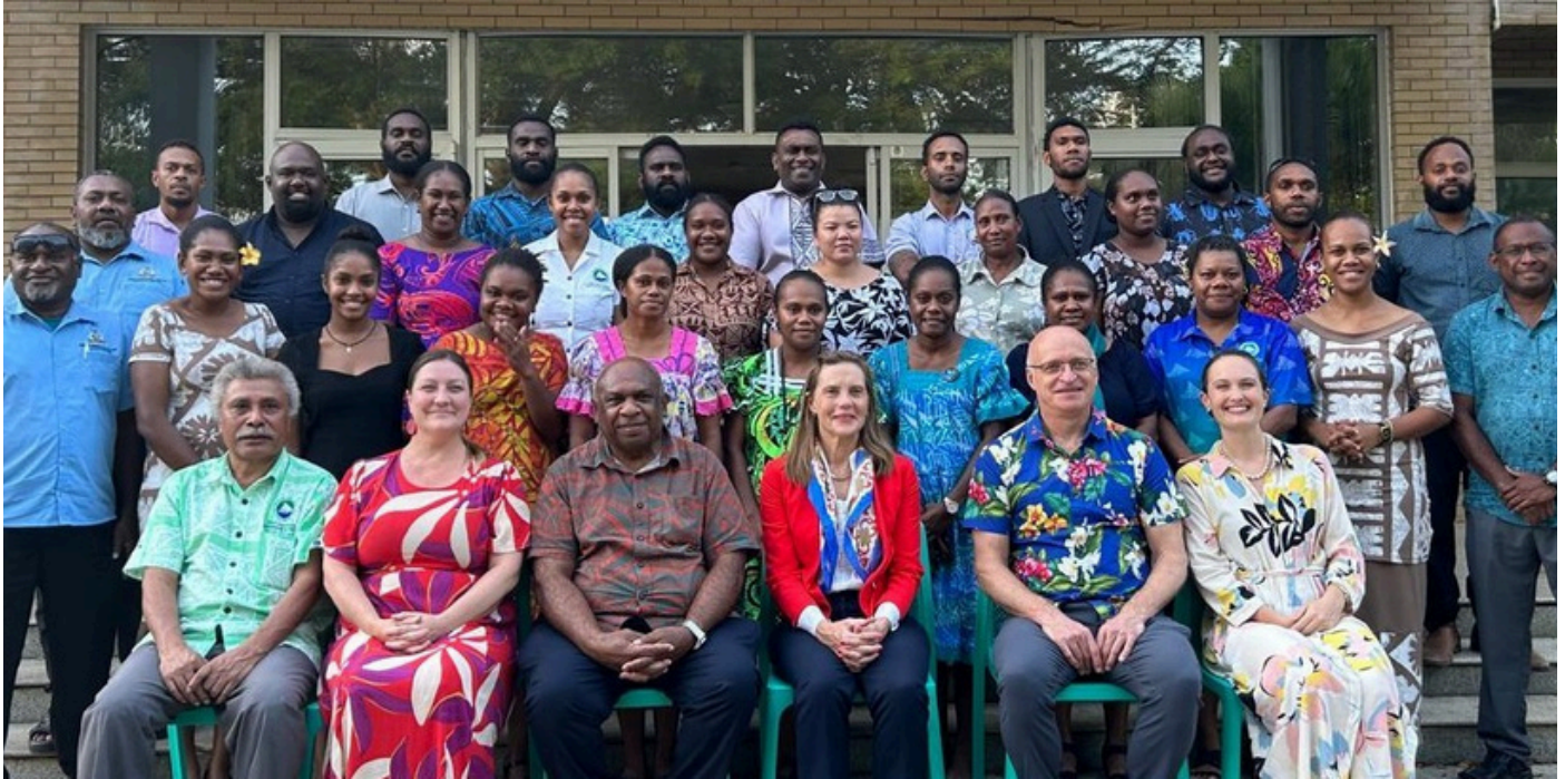
Participants from the MSG Secretariat and the Vanuatu Foreign Affairs after receiving their certificates.

A group of early to mid-career Ministry of Foreign Affairs, International Cooperation & External Trade (MFAICET) officers received valuable diplomatic and protocol training through an Australian-led professional development course in Port Vila. The training was hosted at the headquarters of the Melanesian Spearhead Group (MSG) Secretariat which also included four of its staff.