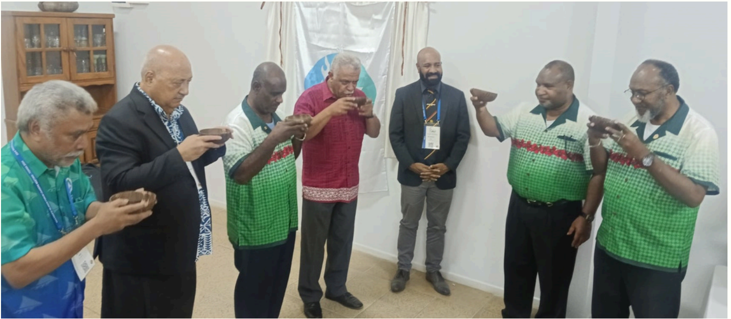
MSG Leaders sharing a light moment over kava during the 53rd Pacific Islands Forum Leaders Meeting.

The Melanesian Spearhead Group (MSG) Leaders' Caucus was successfully convened in Nukua'Alofa, Tonga, within the margins of the 53rd Pacific Islands Forum Leaders Meeting to develop joint positions on issues of specific relevance and of particular concern to the Group.