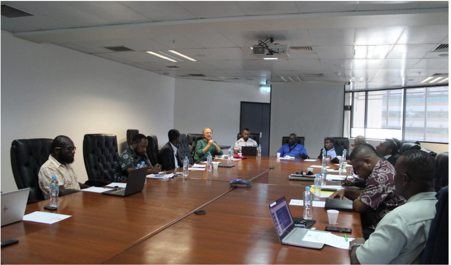
Representatives from Papua New Guinea's NGOs and CSOs during the MSG Security Strategy consultations.

A second round of consultations on the Melanesian Spearhead Group (MSG) Security Strategy with Papua New Guinea's civil society organisations and NGOs was successfully completed in Port Moresby on August 30, 2024.