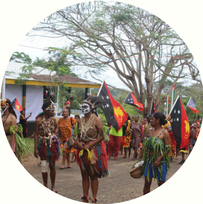
The people of Papua New Guinea in Port Vila celebrated their 49th Independence this month.