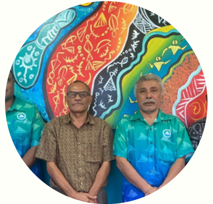
The MSG is facilitating Vanuatu & PNG Foreign Investment Agency cooperation.