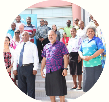
The Secretariat was part of an SPC People Centred Approach workshop.