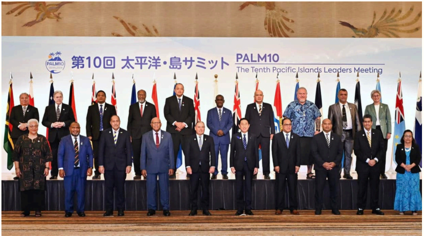
MSG Leaders at the 10th Pacific Island Leader's Meeting (PALM10) in Japan.