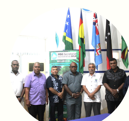
The Secretariat received a delegation from the Solomon Islands.