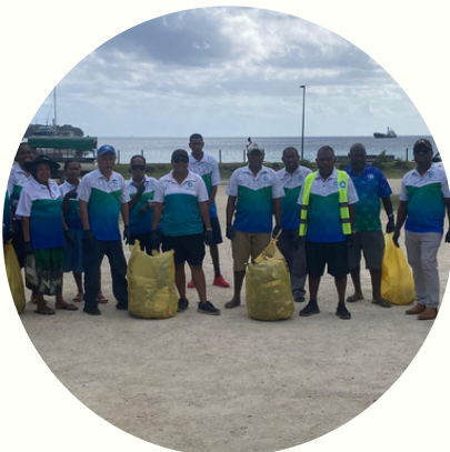
The Secretariat took to cleaning up parts of Port Vila to mark World Clean Up Day.